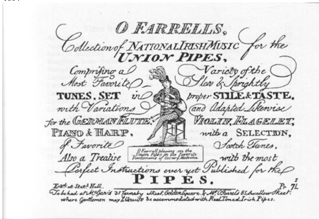
The above scanned image taken from edition II. Thanks to Patrick Sky for permission to use it.

title; pp 1-16, tutor; pp 17-53, tunes (69).